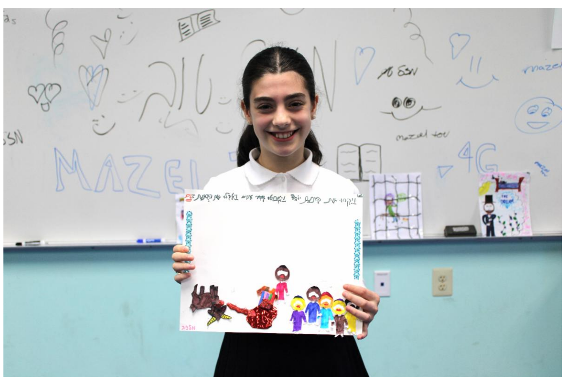
Gut Chodesh to all from our 3rd grade talmidos! We love watching them parade through the hallways and stop in every classroom to wish a gut chodesh to our students and faculty.