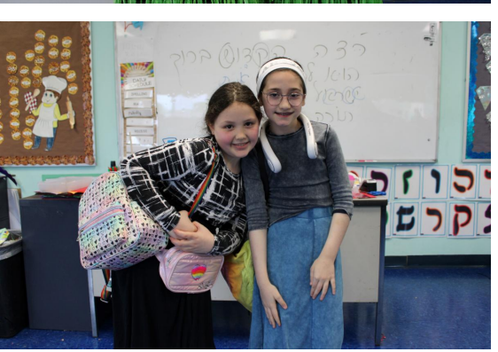
Every girl is a link in the chain. In honor of Rosh Chodesh lyar, girls in grades 1-4 joined together to create chains with a focus on middos and מצוות pertaining to פירה during בין אדם לחברו.